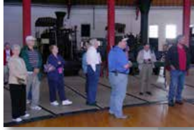
Part of the group on our guided