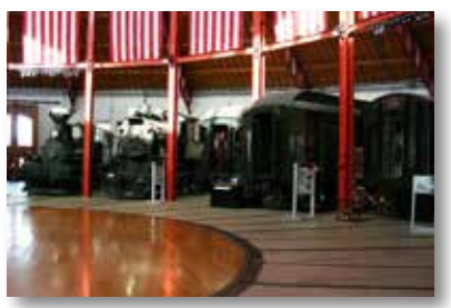
Roundhouse at the B&O Railroad Museum.

View from the Baltimore Museum of Industry,