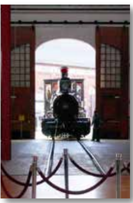
A newly restored locomotive rejoining the collection.