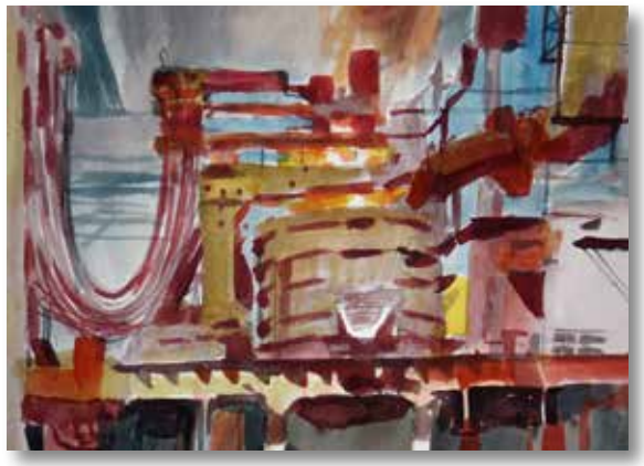
Lukens Electric Furnace